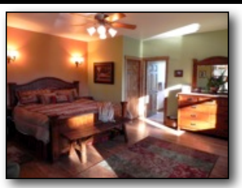
Moose Roost Master Suite (King)

1/2 Bathroom 4 (main floor) Toilet, serves as an extra bath in large oversized, mud room/laundry area with full size washer/dryer, large granite folding counter and over-sized stainless steal utility sink and mirror.