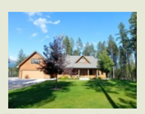
Mystic Mountain, where solitude invites you to surrender to the majestic beauty and peaceful surroundings.

<u>Gourmet Kitchen</u>: Provides fully equipped kitchen supplies for up to 12 guests; granite counters, stainless steel appliances, a double convectional oven,