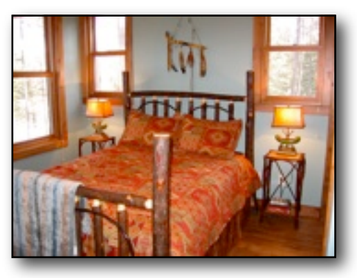
Native Pride Guest Suite (Queen)

Everything you need to experience the old west side of the Montana cowboy mixed with the old time Hollywood actor. As our father was a western actor from Hollywood and an Academy voter, we have added many authentic elements from his career.