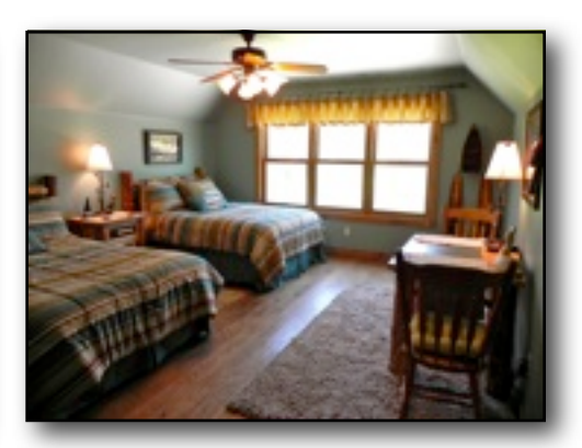
Lady of the Lake (2 Full Beds)

Above the master is second floor with two additional bedrooms and a full, good size bathroom between them. The hall provides a kid zone play area stocked with toys, books, games, DVD's, puzzles, cars, trucks.