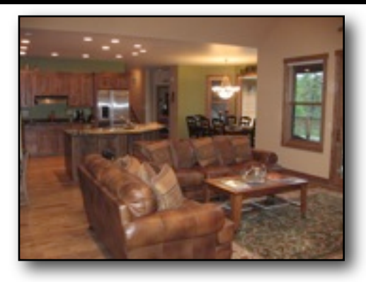
Great Room and Gourmet Kitchen

The Bear's Den serves as a library, card room and media viewing area with a 42" HD flat screen and extensive DVD movie collection for the entire family. Games, puzzles, cards and poker chips added for those rare moments you will be indoors after a day of discovering the great outdoors. Sofa sectional also folds out to an additional queen sofa bed with enhanced mattress. Double doors can be closed for quiet privacy.